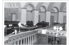
OLD SUPREME COURT CHAMBER

With so many services occurring, the Hall of the House was not the only location in the Capitol where church services were conducted. John Quincy Adams, in his February 2, 1806, diary entry, describes an overflow service held in the Supreme Court Chamber, 28 and Congressman Manasseh Cutler describes a similar service in 1804. 29 (At that time, the Supreme Court Chamber was located on the first floor of the Capitol.) Services were also held in the Senate Chamber as well as on the first floor of the south wing.