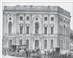
CAPITOL IN 1800

Many people are surprised to learn that the United States Capitol regularly served as a church building; a practice that began even before Congress officially moved into the building and lasted until well after the Civil War. Below is a brief history of the Capitol's use as a church, and some of the prominent individuals who attended services there.