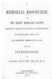
HENRY H. GARNET AND HIS DISCOURSE

Garnet was invited to preach a sermon in Congress to commemorate that event. In his sermon, Garnet described his beginnings: ‘I was born among the cherished institutions of slavery. My earliest recollections of parents, friends, and the home of my childhood are clouded with its wrongs. The first sight that met my eyes was my Christian mother enslaved.’ 33 His family escaped to the North; he became a minister, abolitionist, temperance leader, and political activist. He recruited black regiments during the Civil War and served as chaplain to the black troops of New York. In 1864, he became the pastor of the Fifteenth Street Presbyterian Church in Washington, D. C. (where he served at the time of this sermon). He later became president of Avery College and was made Minister to Liberia by President Ulysses S. Grant.